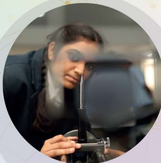
ATAL TINKERING LAB