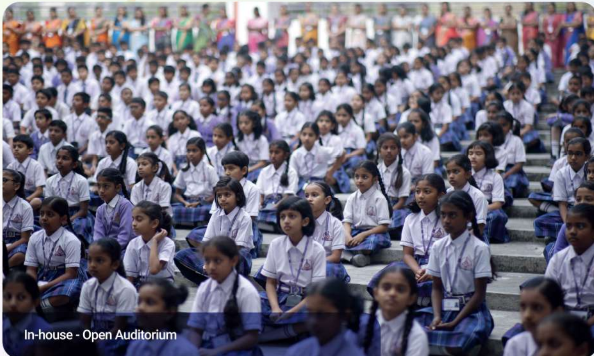
In-house - Open Auditorium