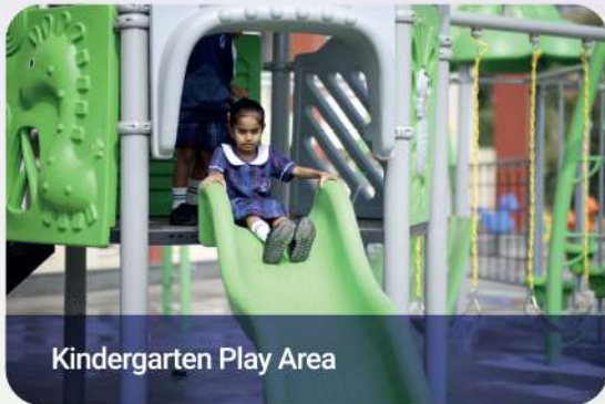
Kindergarten Play Area