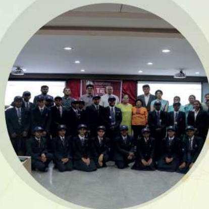
2018 Organized Inter-school Swim meet