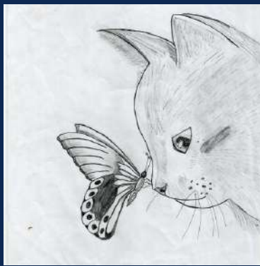
SHREYA S -III 'D'