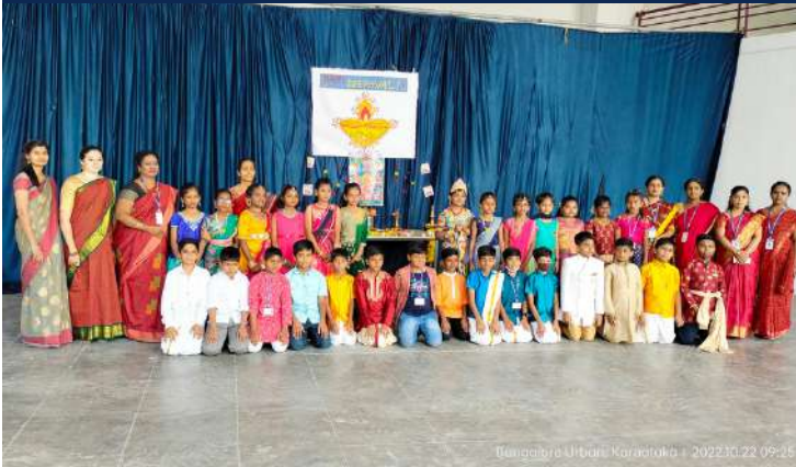
Soundarya Central School | 2022-10-22 09:35