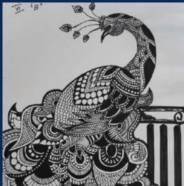
PRAJWAL C GOWDA - VI 'B'