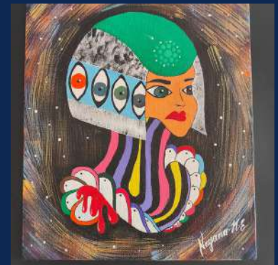
NAYANA H E - X 'C'