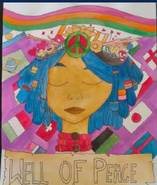
POOJA K R -X 'A'