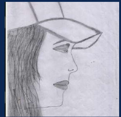
REDA -IV 'C'