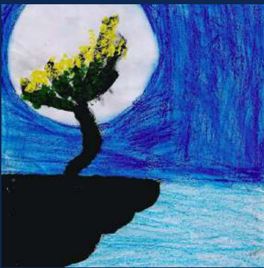
BHASHVIKA PRAVEEN - III 'D'